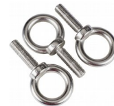
Optional 3 x M-10 fly bolts