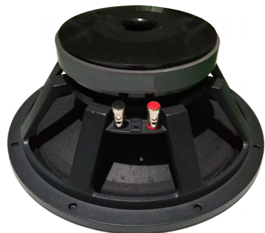
Cast frame 500W 12 driver 4"VC